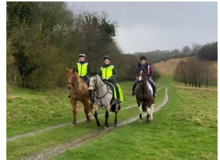
A BIT WET UNDER FOOT BUT LOTS OF SMILEY FACES