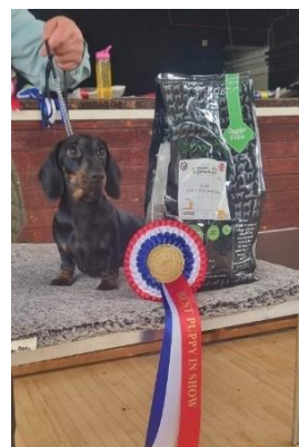
Best Puppy in Show