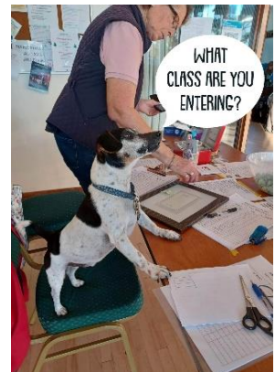
Loki the Sec's Helper